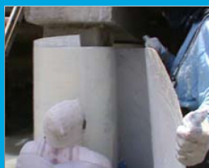
Wrap PileMedic around deteriorated pile to create a double-layer cylindrical jacket