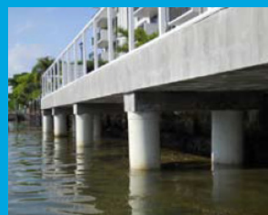
Wait 24 hours for the underwater resin to cure and remove the ratchet straps