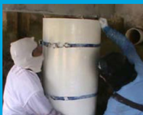
Temporarily support the jacket by wrapping a couple of ratchet straps around it