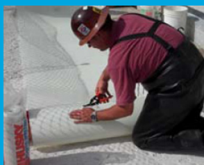
Cut PileMedic sheet to desired size

The main advantages of this system is that it is easy to install, no structural component of the structure has to be taken out of commission during remedials and huge benefit is that the strength of the outer casing laminate "confinement" can be utilized in strength calculations as compared to other join systems and test results show that it is 8 to 10 times stronger than other systems.