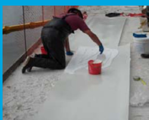
Mix QuakeBond 2200UR (Underwater Resin) and apply Quakebond 2200UR to the back of the Pilemedic