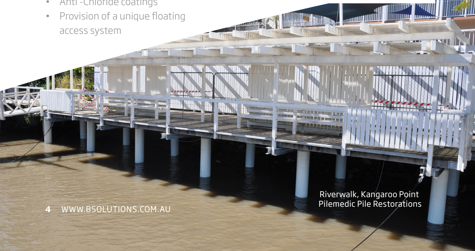
Riverwalk, Kangaroo Point Pilemedic Pile Restorations