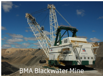
BMA Blackwater Mine