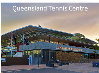
Queensland Tennis Centre