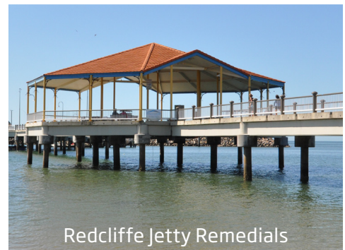
Redcliffe Jetty Remedials