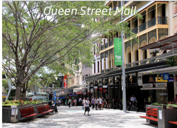
Queen Street Mall