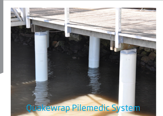
Quakewrap Pilemedic System