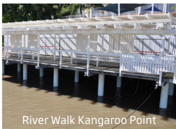
River Walk Kangaroo Point