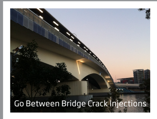
Go Between Bridge Crack Injections

Building Solutions Brisbane has access to the latest structural technology, qualified engineers and services . We can perform drone inspections of unreachable towers or tanks through to engineered reports and solutions. No matter what the structural issue we can design and provide a solution to any budget requirements.