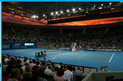
Queensland Tennis Centre Brisbane International Preparation