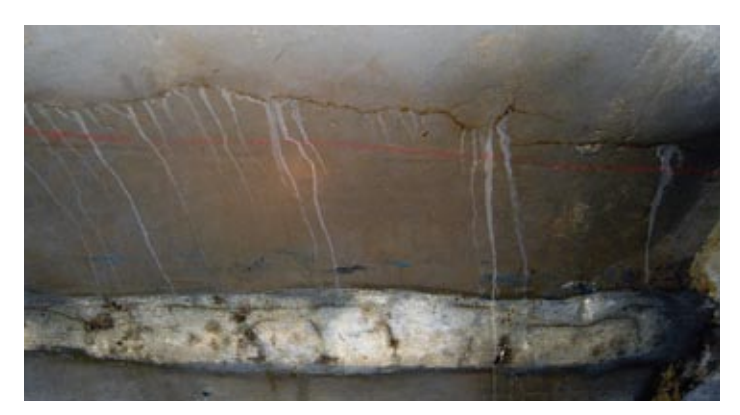
Fig. 3: Water seeping into pipeline

Moreover, the cracks generated multiple paths for humidity intrusion that reached the steel reinforcement of the pipeline, allowing for corrosion problems that, if not properly addressed, could compromise the structural integrity of the pipeline in the future. Complicating the problem even further was the combination of mountainous topography and