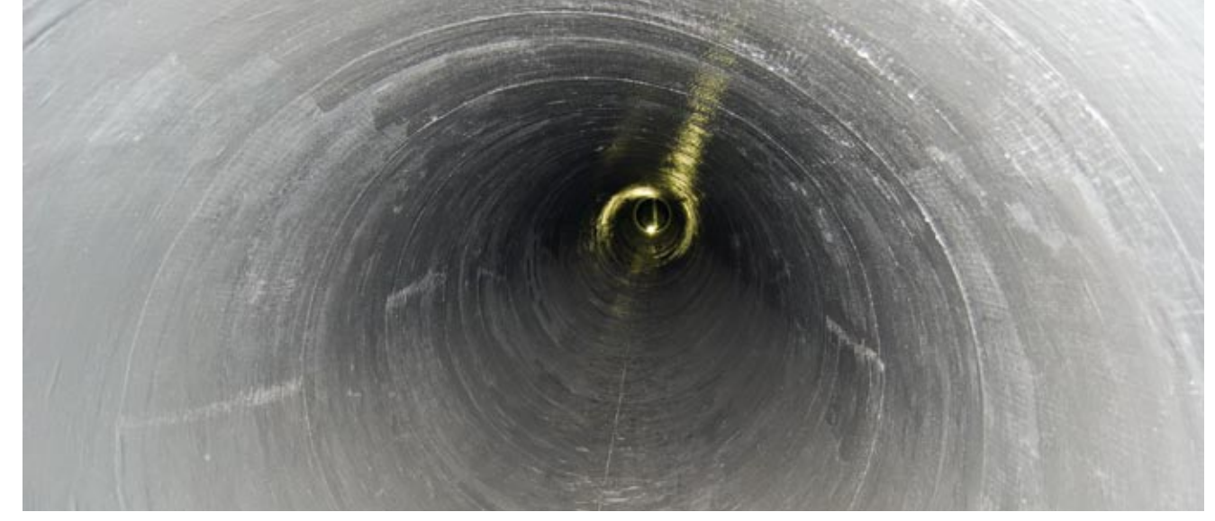
Fig. 8: Completed segment of pipeline prior to testing

achieve full continuity of the FRP. The edges of the overlaps were feathered with epoxy paste and/or epoxy resin to secure the overlaps in the lining in place.