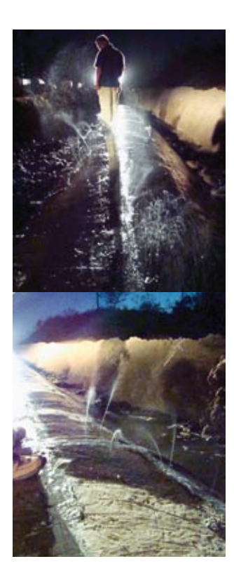
Fig. 2: Leaking after conventional crack sealing

The pipeline was drained and all visible cracks were sealed using typical repair materials. When the pipeline was pressurized for a second time, the repaired cracks leaked again. The leaking