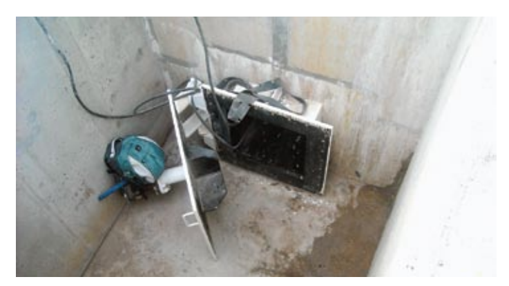
Fig. 5: Typical 2 ft. x 2 ft. access point

An epoxy paste was applied to the top half of the pipeline; the main purpose of the paste is to prevent peeling due to self weight of the saturated FRP fabric and to seal the surface to prevent excessive absorption by the dry concrete surface of the epoxy resin from the saturated FRP fabric. Figure 6 shows the installation of the first roll of FRP lining material at one of the installation stations. The access point is clearly visible on the lower left portion of the figure. No epoxy paste was used in the lower half of the pipe. Because gravity forces in this area tend to hold the FRP fabric in place, only a seal coat of epoxy resin was used to prevent excessive absorption by the dry concrete surface of epoxy resin from the saturated fabric. The edges of the 50 in. (1270 mm) wide bands of fabric were adequately overlapped in the hoop and longitudinal directions to